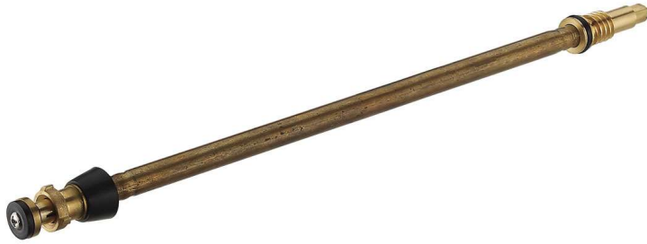
Full Turn Faucet Replacement Stem