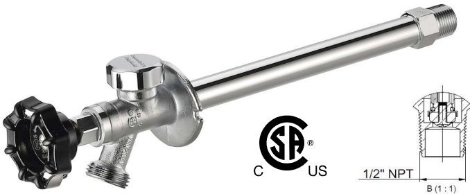
Full Turn/1/2" NPT/SWEAT